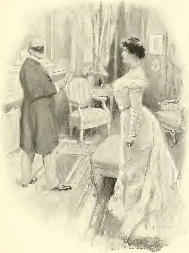
She stood without flinching before a masked ruffian.